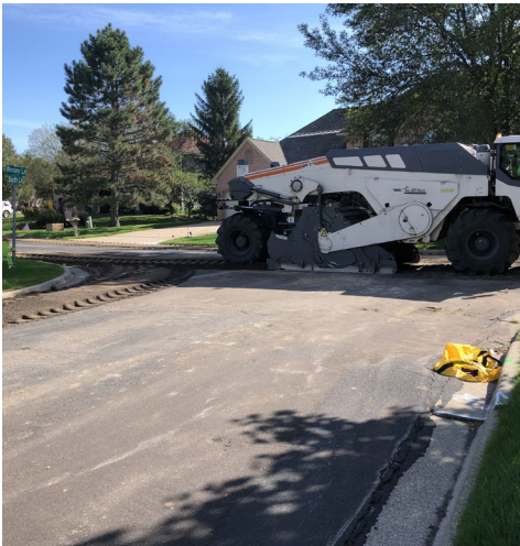
Example of pavement reclamation