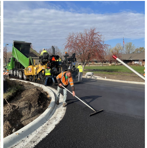
Example of pavement resurfacing